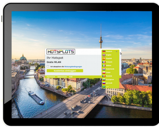
The HOTSPLOTS login page is available in several languages.

HOTSPLOTS is always on hand to provide its customers with technical know-how and comprehensive services. These range from billing models , filter solutions (e.g. youth protection) and VPN routing through to central 24/7 hotspot monitoring .