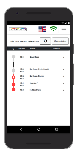
Display of passenger information in the WiFi portal