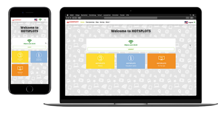
Sample representation: WiFi portal start page (responsive)

Entertainment offers are made available locally on the system and are therefore also available offline. If desired, updates of daily offers can be automated via the HOTSPLOTS Content Delivery Network (CDN) service.